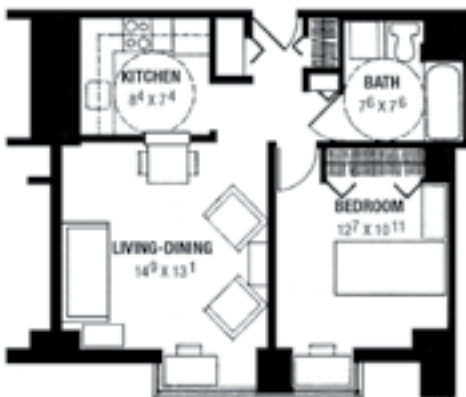
THE SOHO GRAND Standard Accessible