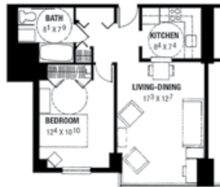
THE MANHATTAN GRAND Deluxe Accessible