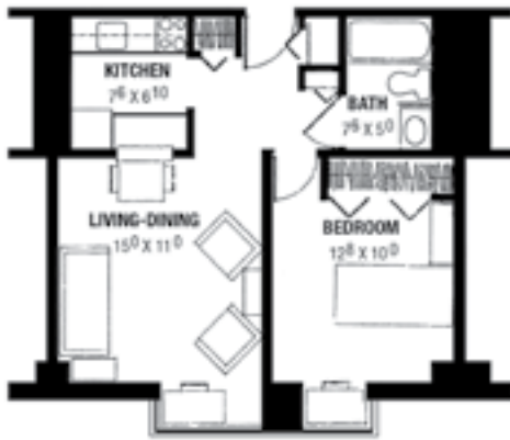
THE SOHO Standard 1-bedroom

Revitz House offers a selection of 1-bedroom apartment homes. All of our floorplans are available at below-market rates to qualified individuals. Our Resident Services Coordinator will assist with your transition.