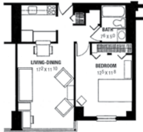
THE MANHATTAN Deluxe 1-bedroom