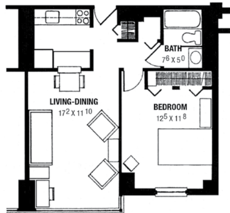
THE MANHATTAN Deluxe 1-bedroom