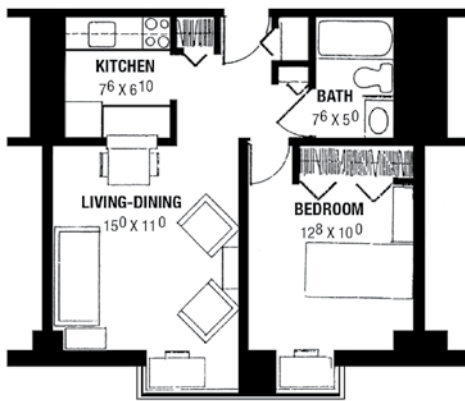
THE SOHO Standard 1-bedroom

Revitz House offers a selection of 1-bedroom apartment homes. All of our floorplans are available at below-market rates to qualified individuals. Our Resident Services Coordinator will assist with your transition.