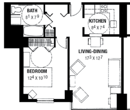
THE MANHATTAN GRAND Deluxe Accessible