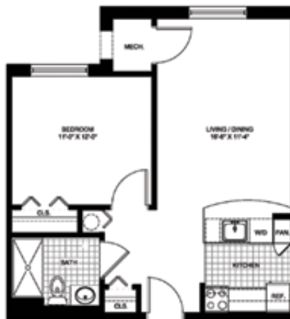
THE STRATHMORE 1 bedroom / 1 bath