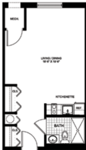
THE KENSINGTON Studio