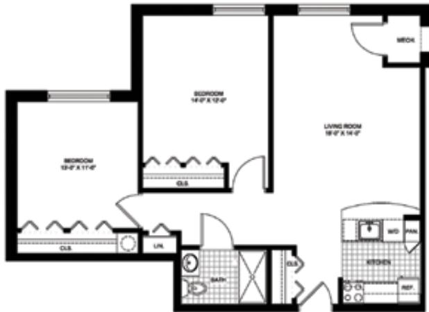
THE CONGRESSIONAL 2 bedroom / 1 bath

Ring House offers a selection of studio, 1- and 2-bedroom apartment homes. There are select floorplans at below-market rates to qualified individuals. Our Resident Services Coordinator will assist with your transition.