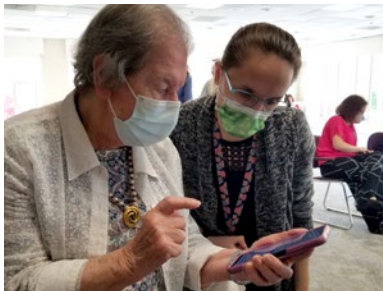
Ring House resident receives Cubigo training from an associate.