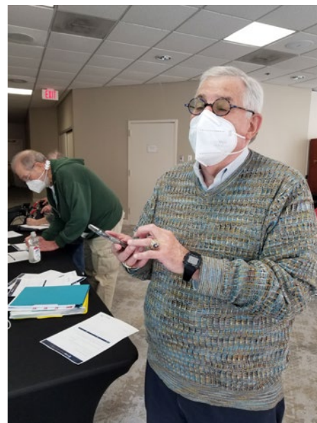
Ring House resident registers for Cubigo on his smartphone.