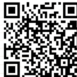
Perspectives: Living our values (Part 1)

In 2023, Hebrew Home of Greater Washington's values were presented to over 3,000 attendees at the American Health Care Association and the National Center for Assisted Living (AHCA/NCAL) 74th annual conference in Denver. Our unwavering commitment to residents and families was showcased in two video that inspired many. Please scan the QR codes to watch how our values guide the work of associates when serving Hebrew Home of Greater Washington residents and their loved ones.