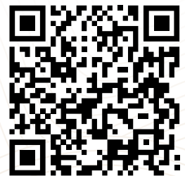
Perspectives: Living our values (Part 2)