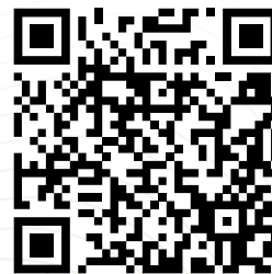
Perspectives: Living our values (Part 1)

In 2023, Hebrew Home of Greater Washington's values were presented to over 3,000 attendees at the American Health Care Association and the National Center for Assisted Living (AHCA/NCAL) 74th annual conference in Denver. Our unwavering commitment to residents and families was showcased in two video that inspired many. Please scan the QR codes to watch how our values guide the work of associates when serving Hebrew Home of Greater Washington residents and their loved ones.